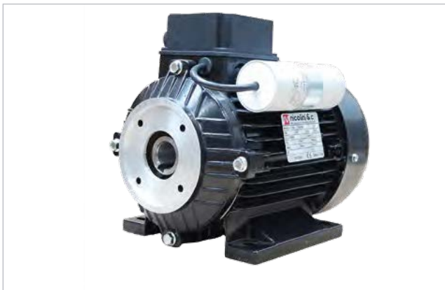
E-motor - 450200 / 450205 / 450207