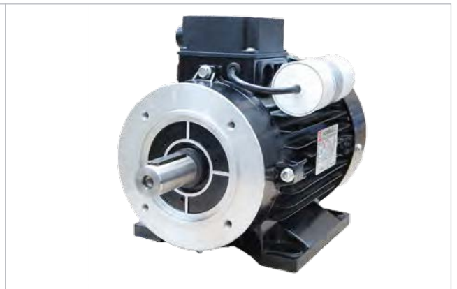
E-motor - 450235