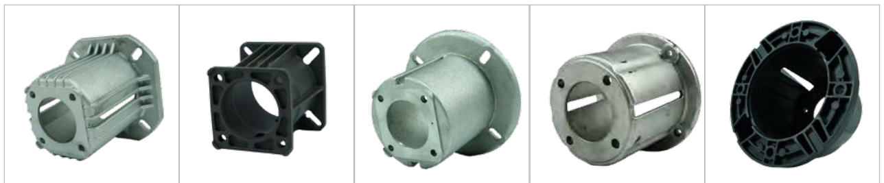
ZF044 / 502200